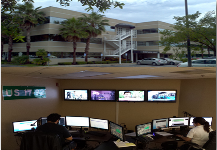
ORLANDO OPERATIONS CENTER

We generate and maintain the traffic data and reports together, by using vast resources which include agreements with full DOT camera access, local & state police and fire rescue CADS, direct scanner feed access, flow sensor data, air and ground units (market specific), social media, crowd sourcing and much more. We use all these resources together, verifying the incident and the impact of traffic flow. This verified data is then generated and distributed out on the Tele-Traffic Dashboard product as well as the Tele-Traffic App with accurate, dependable and timely information. We continuously update the Tele-Traffic products whenever anything changes.